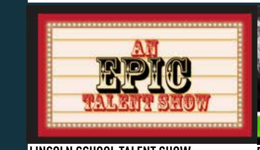
LINCOLN SCHOOL TALENT SHOW

Show your support for community theatre in Skagit Valley by playing a spirited round of golf or becoming a sponsor of The Fifth Annual Drive for the Arts. The format is a scramble: each player hits and the team takes the best of the four shots. All players welcome regardless of skill level! After the tournament, join us for appetizers and an auction. Go to lincolntheatre.org for more information.