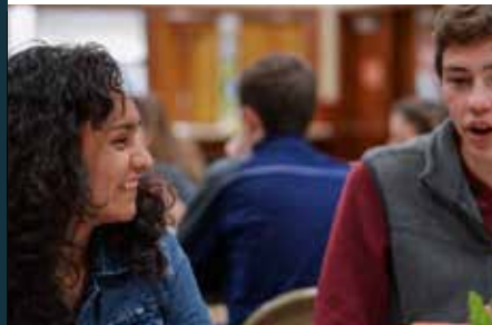
OUR SHARED STORY: COMPASSION