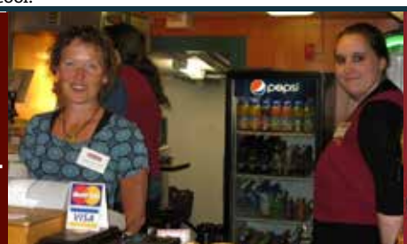
VOLUNTEER AT THE LINCOLN!

The Lincoln Theatre is supported by more than 800 members from every corner of Skagit. Whatcom and Snohomish counties as well as towns and cities throughout Washington, British Columbia, and around the world. Become a member today and make sure the curtain keeps rising!