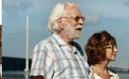
THE LEISURE SEEKER June 1-4

Regular Film Prices | 101 minutes | PG13