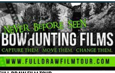
FULL DRAW FILM TOUR

Lincoln Elementary again brings its talented students downtown to present their annual Talent Show. Students in grades one through five audition to be part of this wonderful community event, with only the best acts accepted. Lincoln Elementary is populated with many talented children, so expect a great show of dance, music, drama and more!