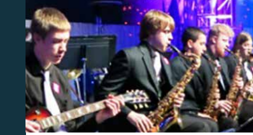
MVHS JAZZ & MARIACHI

BOX OFFICE HOURS Monday - Friday 12-5pm and two hours before live events, 45 mins before films and broadcasts TICKETS ALSO AVAILABLE online at lincolntheatre.org