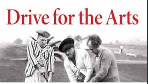
DRIVE FOR THE ARTS

Based on the popular comic strip by Harold Gray, Annie has become a worldwide phenomenon and was the winner of seven Tony Awards, including Best Musical. The beloved book and score by Tony Award winners, Thomas Meehan, Charles Strouse and Martin Charnin, features some of the greatest musical theatre hits ever written.