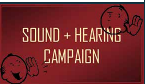
SOUND + HEARING CAMPAIGN

Concessions volunteers enjoy a free show, popcorn and fountain drinks. Find Volunteer Application and Disclosure Form at lincolntheatre.org/be-volunteer or in our office. Email to brandy@lincolntheatre.org . Volunteering is conditional on completed application, disclosure form and satisfactory report from the WA State Patrol.