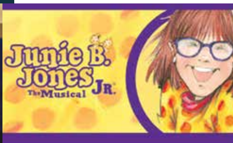
SFLC - JUNIE B. JONES