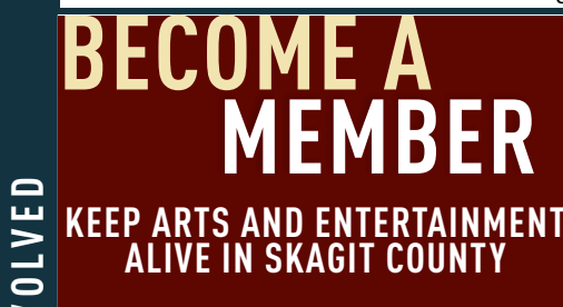
BECOME A MEMBER