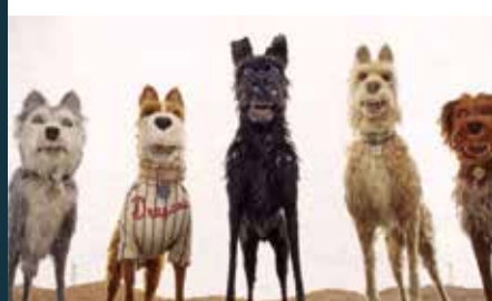
ISLE OF DOGS May 25-28

Canine pets of Megasaki City are exiled to a vast garbage-dump called Trash Island, 12-year-old Atari sets off alone in a miniature Junior-Turbo Prop and flies across the river in search of his bodyguard-dog, Spots. There, with the assistance of a pack of newly-found mongrel friends, he begins an epic journey