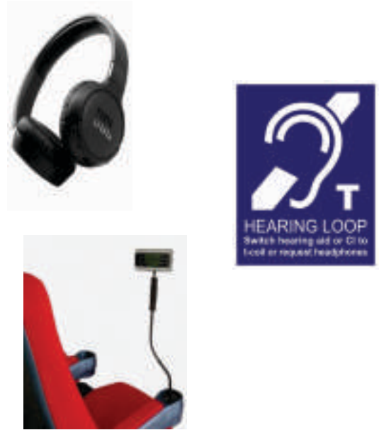
Closed Captioning device

You can bring your own small sensory tools or borrow devices from the Lincoln Theatre. (*please no putty or tools that can leak)